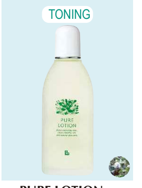
PURE LOTION (SKIN TONER) 100mL ¥3,780

Gentle on skin, uses amino acids and palm oil. Removes dirt without stripping skin of natural