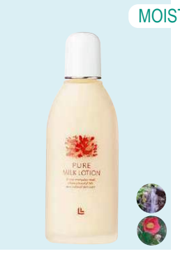
PURE MILK LOTION (MOISTURIZER) 100mL ¥4,104

Loofa extract specially grown by organic farmers moisturizes and whitens skin, prevents freckles and spots due to sun exposure. Formulated with Morus Alba root