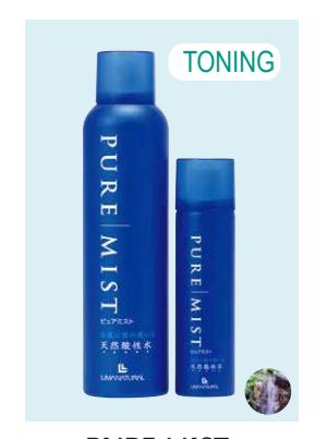
PURE MIST (WATER MIST SPRAY) 150g ¥1,620 / 50g ¥756 PH balanced for women. Water taken from natural springs in Chichibu area of Saitama.