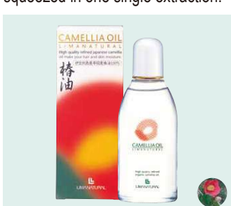
CAMELLIA OIL (REFINED BEAUTY ORGANIC OIL) 80mL ¥3,024

All non-preservative camellia oil squeezed in one single extraction.