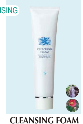
(CLEANSER) 130g ¥2,700

Removes dirt from pores. Wash off after use. Gentle on skin. Formulated with Lithospermum Erythrorhizon root extract, Morus Alba root extract and Scutellaria Baicalensis root extract.