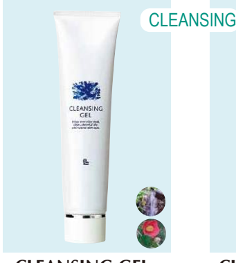
CLEANSING GEL (MAKEUP REMOVER) 125a ¥3,024

Removes dirt from pores. Wash off after use. Gentle on skin. Formulated with Lithospermum Erythrorhizon root extract, Morus Alba root extract and Scutellaria Baicalensis root extract.