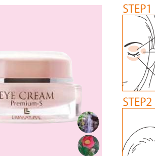
PREMIUM EYE CREAM

Moisturizer for area around eyes and mouth.