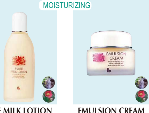
EMULSION CREAM (MOISTURIZER) 30g ¥4,860

Night time lotion recovers skin's smoothness and moisture after damage from everyday sunlight. Formulated with Morus Alba root