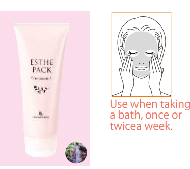
PREMIUM ESTHE PACK (WASH OFF TYPE, FACE PACK) 120g ¥3,456

Wash off mud pack. Removes unnecessary oil, dirt from pores and makes skin seem like crystal. Using tourmaline, sodium hyaluronate, arbutin, and organic chamomile extract. Settles and